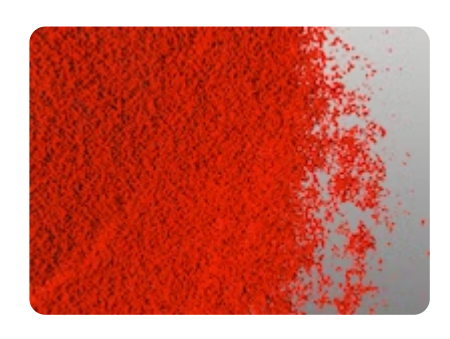
Graphtol Red LC